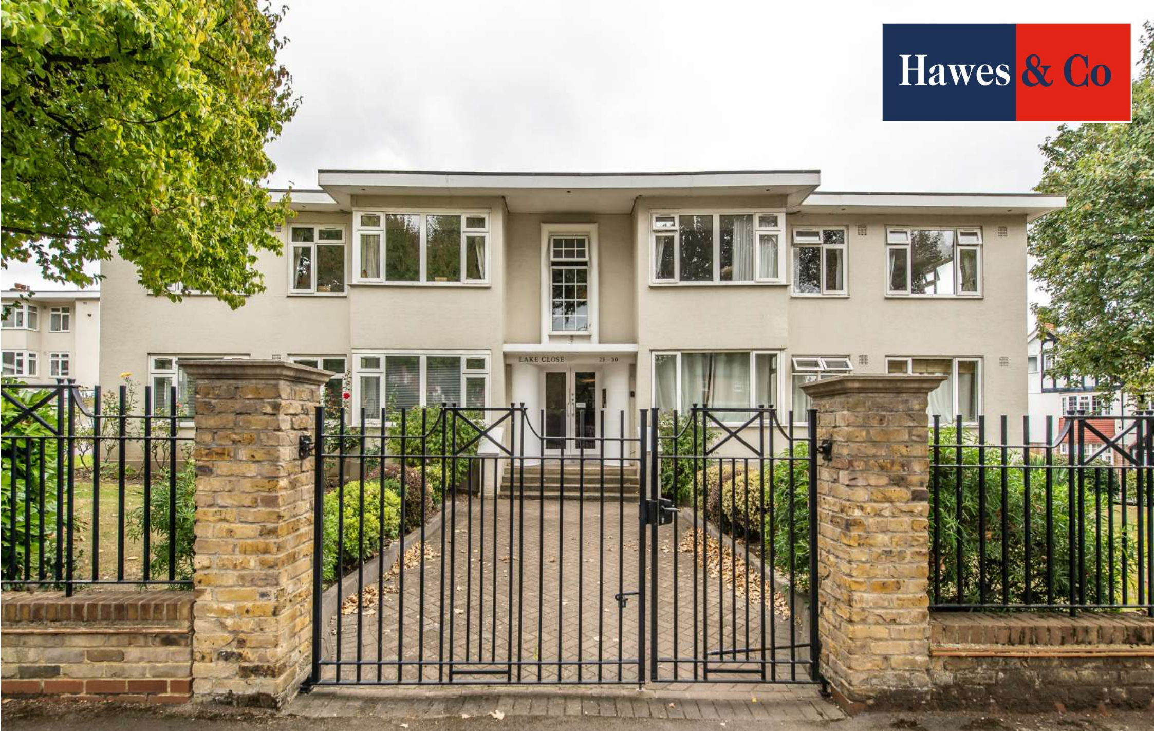
Lake Close, Wimbledon